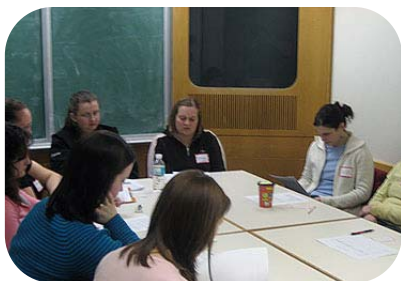
A small-group discussion in St. John's

Distance learning technology was used to enable the participation of students from the west coast. Students from the Western Regional School of Nursing participated in the e-learning and online discussion groups through Web-CT and were able to view the plenary session and participate in the panel discussions by videoconference.