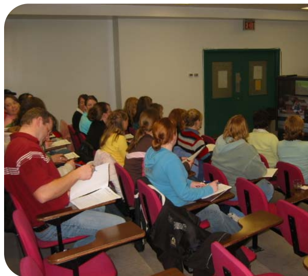
Students from Western Regional School of Nursing in Corner Brook took part in the Geriatric Care Forum by videoconference

Participating students included those of the Faculty of Medicine and Schools of Nursing, Pharmacy, and Social Work. Curriculum development teams, comprised of faculty from the participating schools and faculties, representatives from community service agencies, and other health professionals, designed the learning activities based on a blended learning model. Activities included e-learning, online and face-to-face small-group case study discussions, and a plenary session with a panel discussion. Small groups were comprised of students from each of the participating professions.