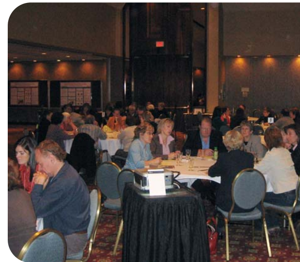
Participants at the collaborative health education symposium discuss strategies for expanding interprofessional education.

The goal of the symposium was to promote interprofessional education by sharing experiences, developing strategies for expanding and growing interprofessional education initiatives, enhancing awareness of key principles and concepts for organizing interprofessional education, and creating a vision for interprofessional education for collaborative patient-centered practice.